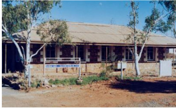
Roebourne School of 1892 (Dept of Environment barcode rp03571)