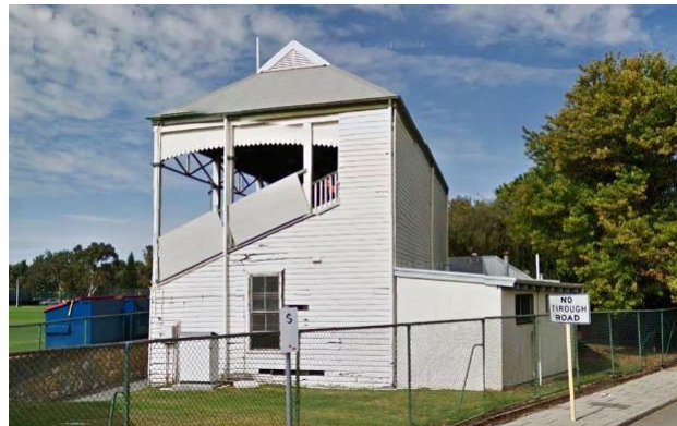
Stone turret to St John's Anglican Church, Fremantle of 1906 (Google 2014); North Fremantle Grandstand of 1910, Gilbert Fraser Reserve (Google 2014).